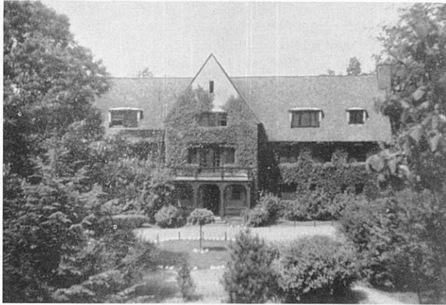
KAPPA'S ATTRACTIVE HOME at Edgecliff which has housed Cornell ZBT's since 1923, and where a warm welcome always awaits alumni and guests.