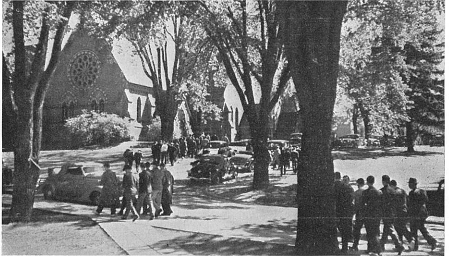
Cornell Alumni News

SCENES SUCH AS THIS will be enacted on the campus over the Cornell Day weekend (weather allowing). This picture was taken from the steps of Willard Straight looking towards Sage Chapel.